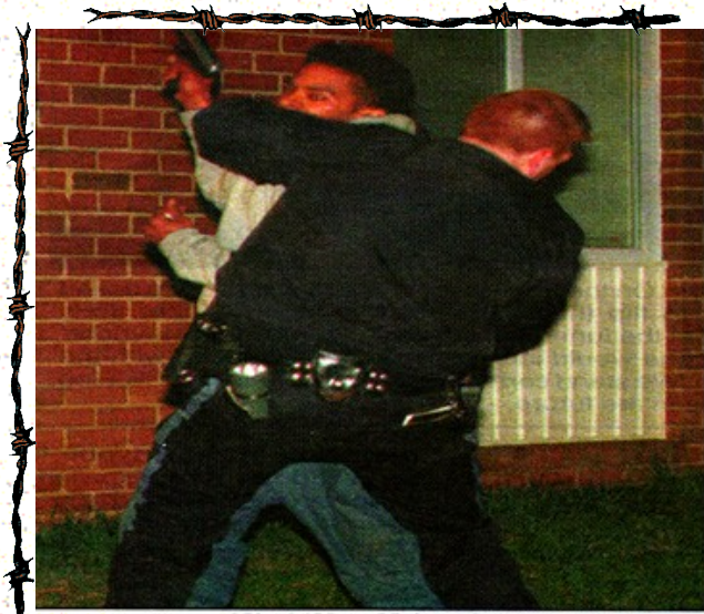
25% skill - 75% Luck